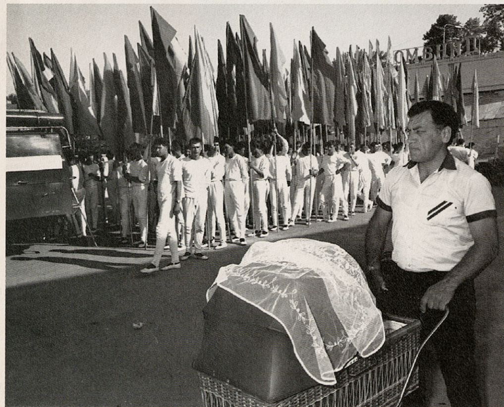
Above: Young recruits commemorate victory in the Second World War with a parade in Samarkand, Uzbekistan

But what can the two women be doing in bathing-costumes in a season such as this? And what is one of them doing with a