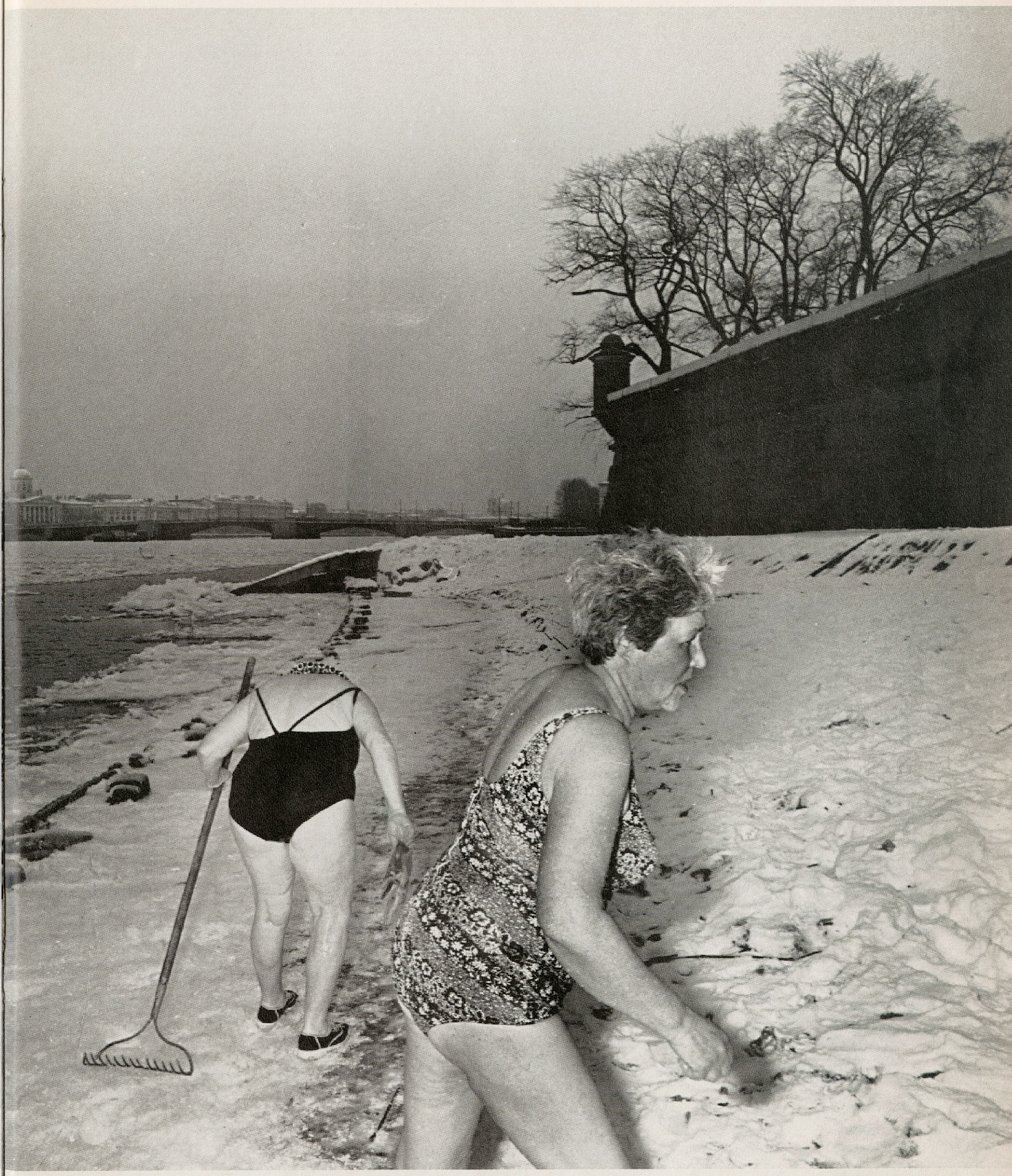
Right: Winter bathers, known in Leningrad as 'walrus', prepare to take a dip in the ice-clad River Neva