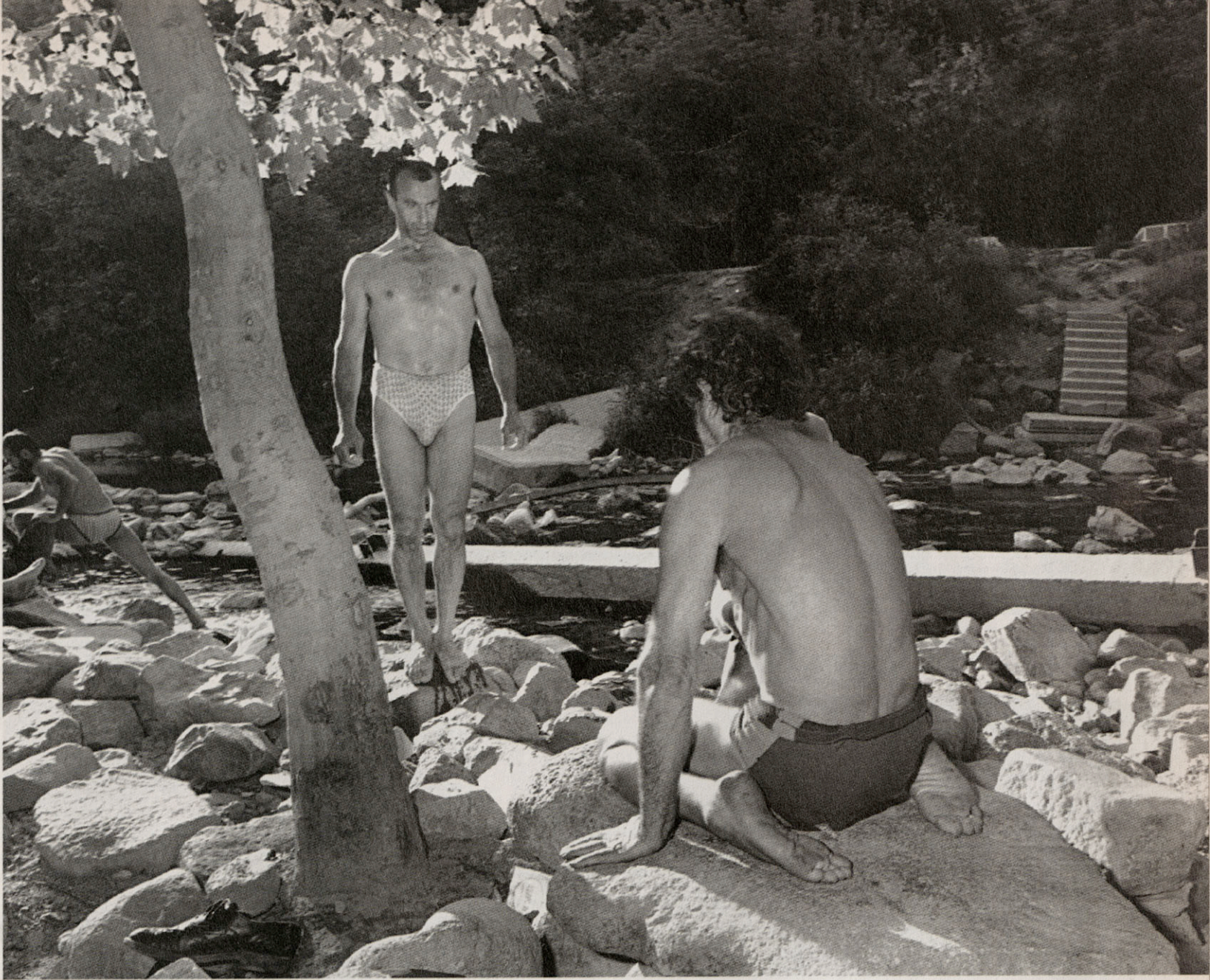
Above: Bathers drying in the sun at a swimming pool on the river in Yerevan, Armenia, where intellectuals and artists meet to play chess and discuss politics