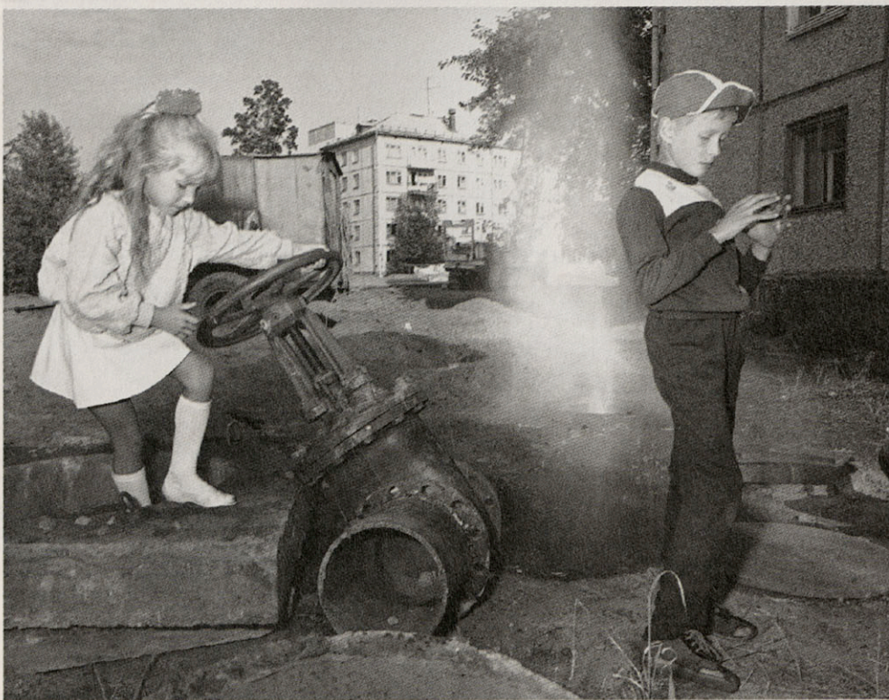
Left: Children playing on a building site in Bratsk, Siberia