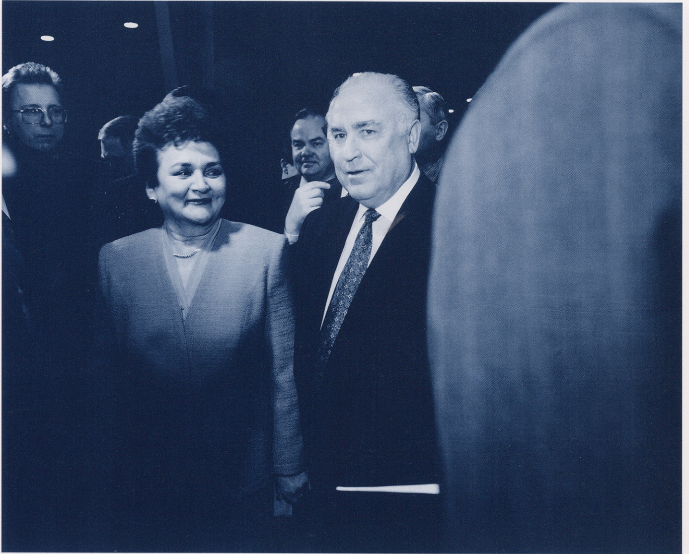
Viktor Chernomyrdin arrives with his wife for the opening session