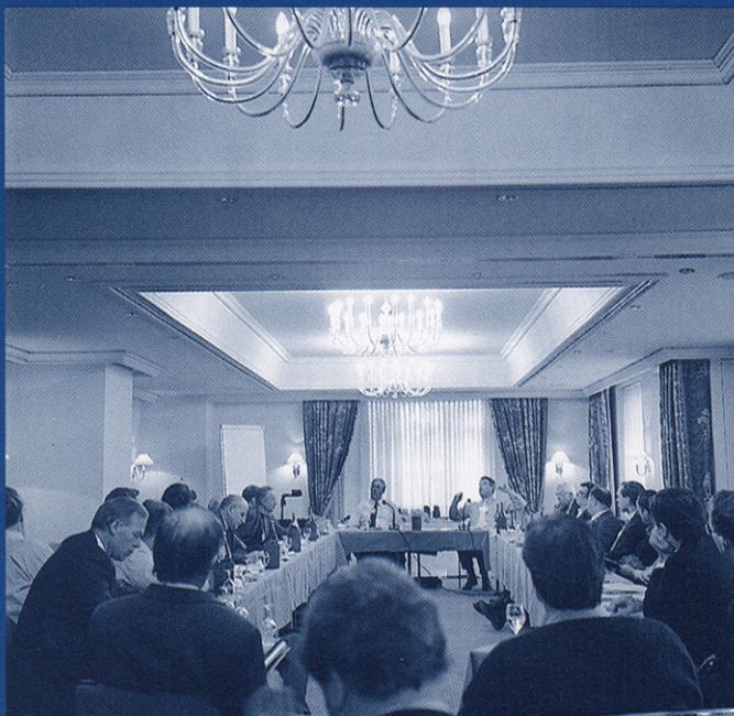
A session of the information technologies governors' meeting