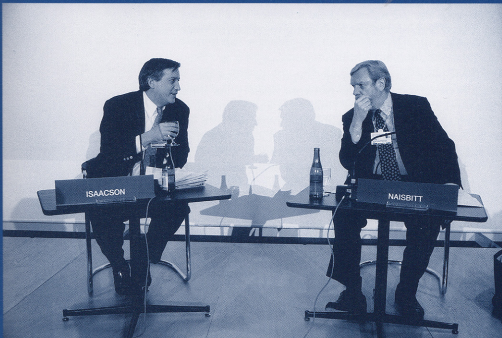
Video communication through WELCOM