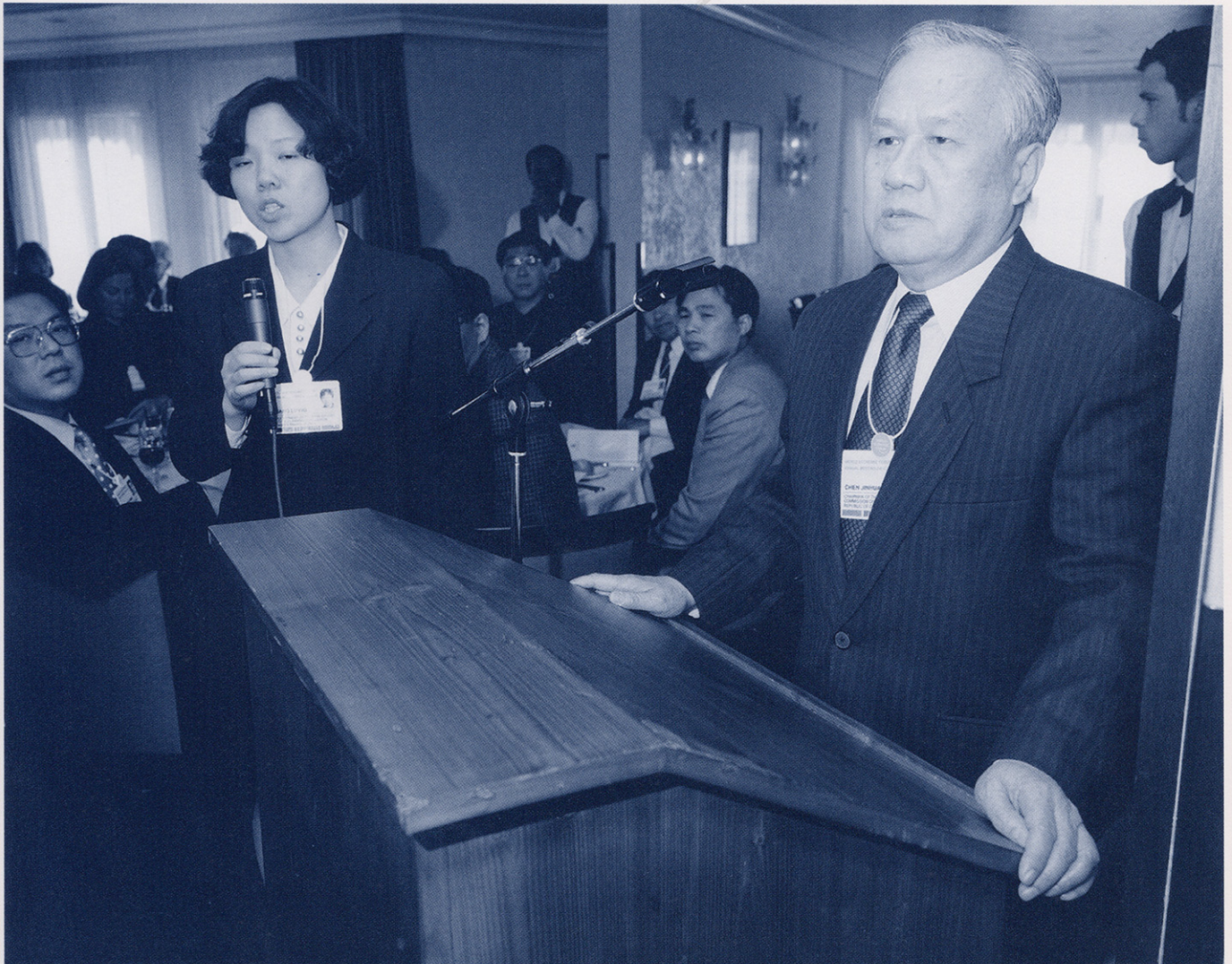
The China networking lunch with Chen Jinhua, Chairman of the State Planning Commission

With scheduled visits to China by senior US officials including Vice-President Al Gore and Secretary of State, Madeleine Albright, there are signs that US-Sino relations are on the mend. This can only augur well for Asia security.