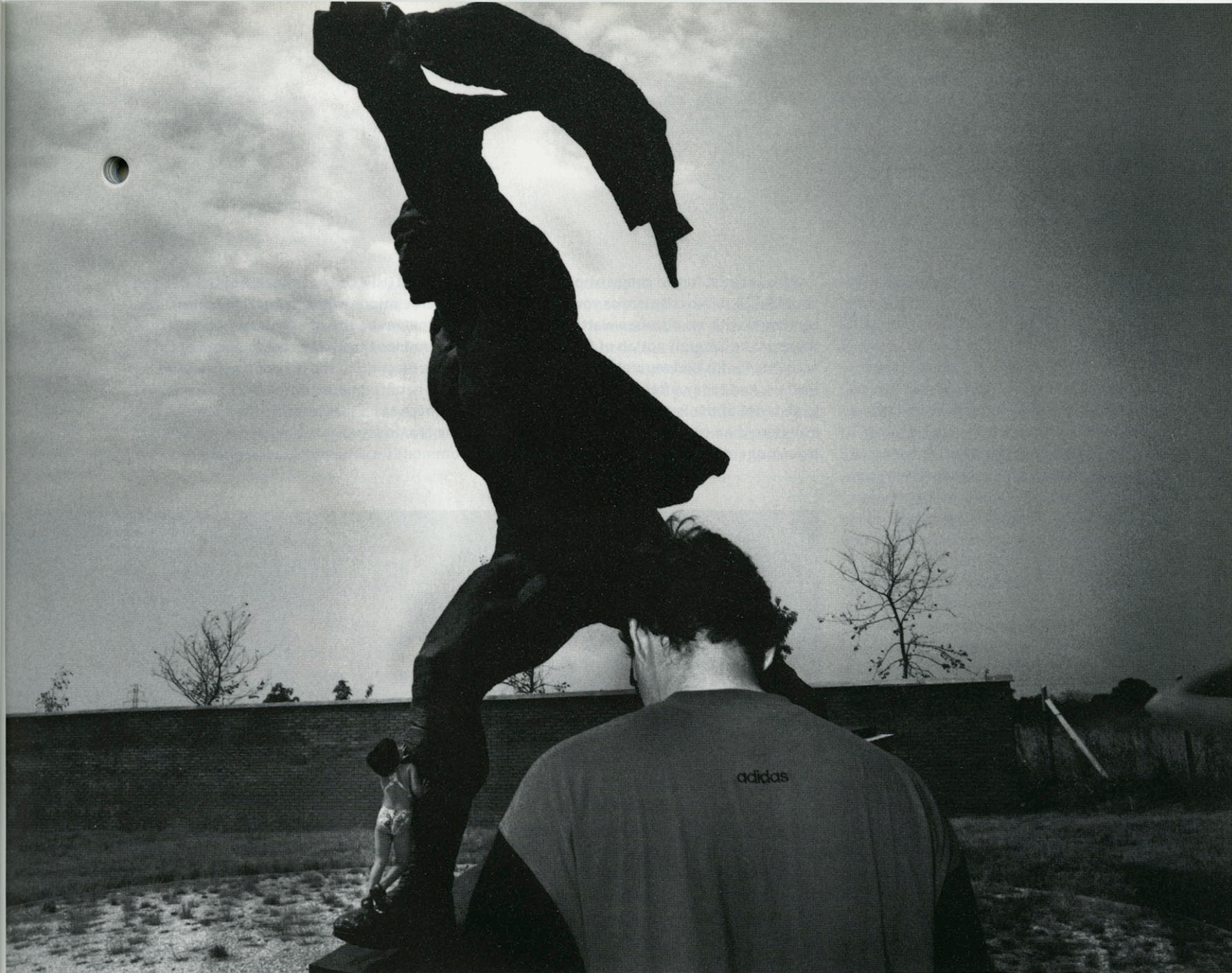
Photo at the "Szobor Park", an open air showroom for communist statues and symbols near Budapest (1996)