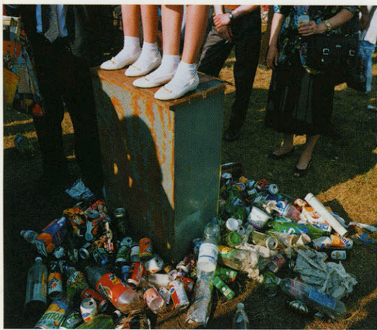
presidential elections in Moscow (1995)