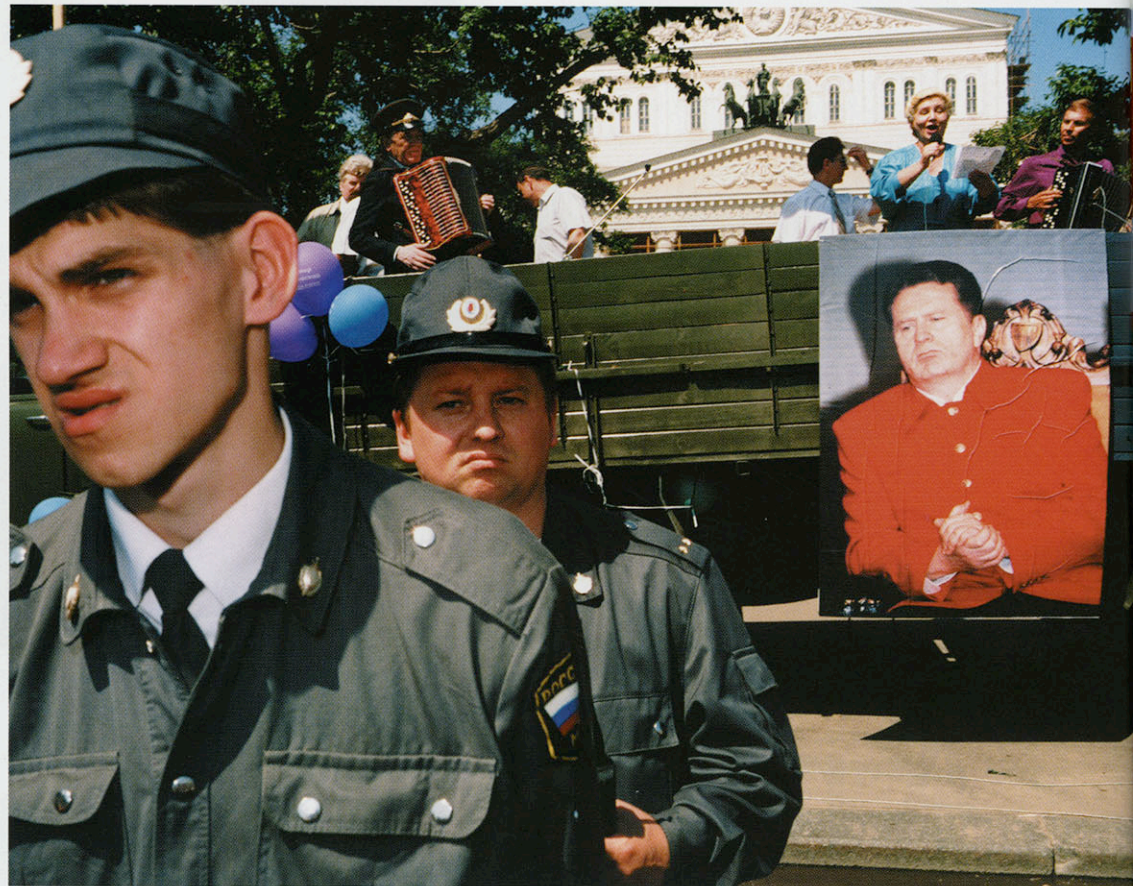
presidential elections in Moscow (1995)

choice WITHIN the coordinates of the existing power relations, while "actual" freedom designates the site of an intervention that undermines these very coordinates. The first public reaction to the idea of reactualizing Lenin is, of course, an outburst of sarcastic laughter: Marx - OK, even on Wall Street, they love him today - Marx the poet of commodities, who provided perfect