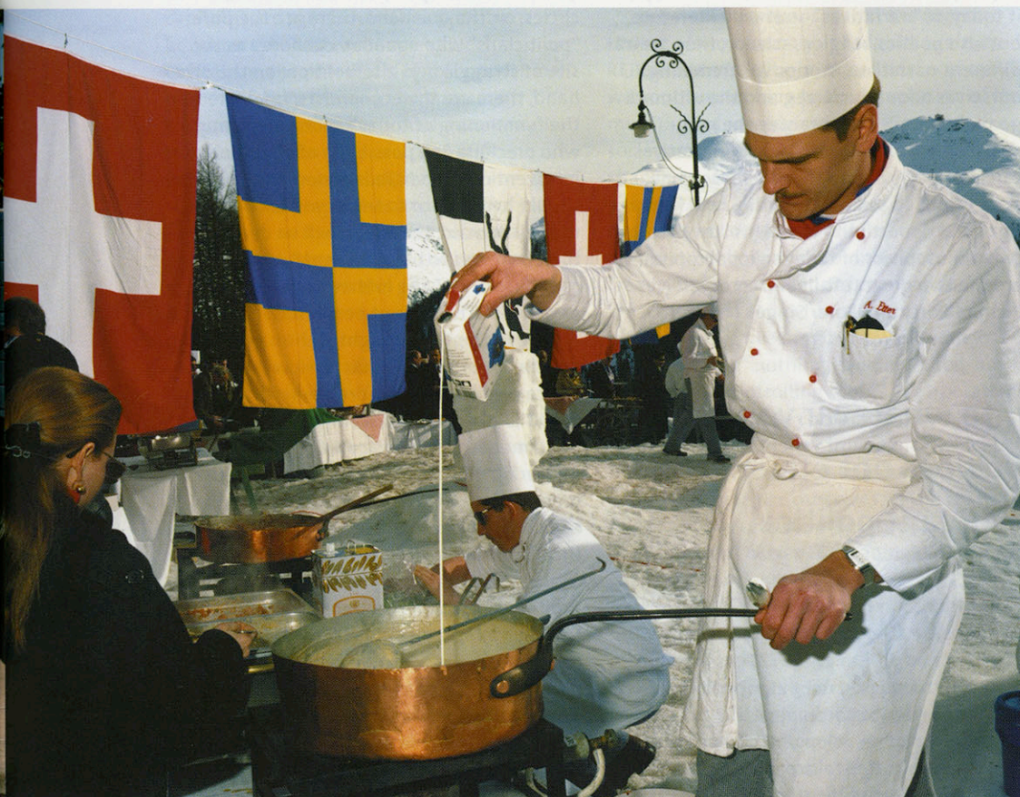
at the World Economic Forum at Davos, Switzerland, an annual gathering of state and large company managers and owners “to discuss the future of the world” (1997)

One is therefore tempted to turn around Marx's thesis 11: the first task today is precisely NOT to succumb to the temptation to act, to directly intervene and change things (which then inevitably ends in a cul de sac of debilitating impossibility: “what can one do against global capital?”), but to question the hegemonic ideological coordinates - or, as Brecht put it in his Me Ti : “Thought is something which precedes action and follows experience.” If, today, one follows a direct call to act, this act will not be performed in an empty space - it will be an act WITHIN the hegemonic ideological coordinates: those who “really want to do something to help people” get involved in (undoubtedly honourable) exploits like Medecins sans frontiere , Greenpeace, and feminist and anti-