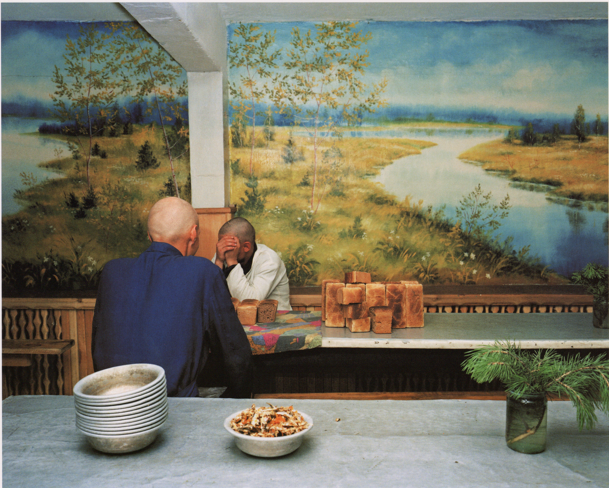
Lunch consists of one cube of bread and a bowl of fish, Krasnoyarsk, 2000