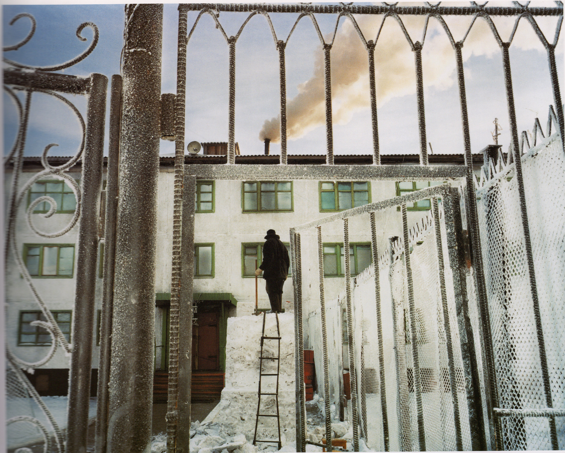
A prisoner works on an ice sculpture for the inter-camp competition, Krasnoyarsk, 2002