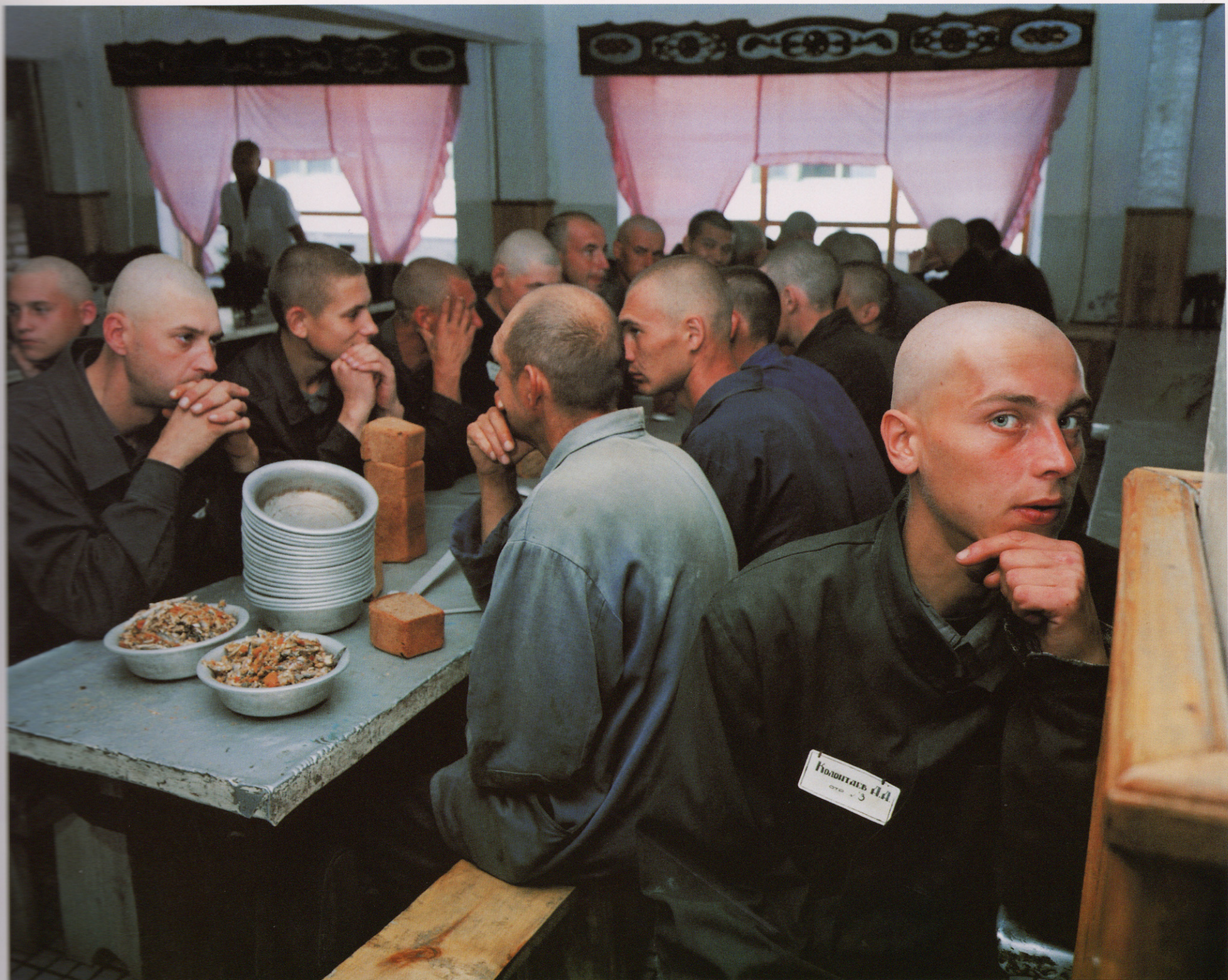
Лангитина, Красноярск, 2000