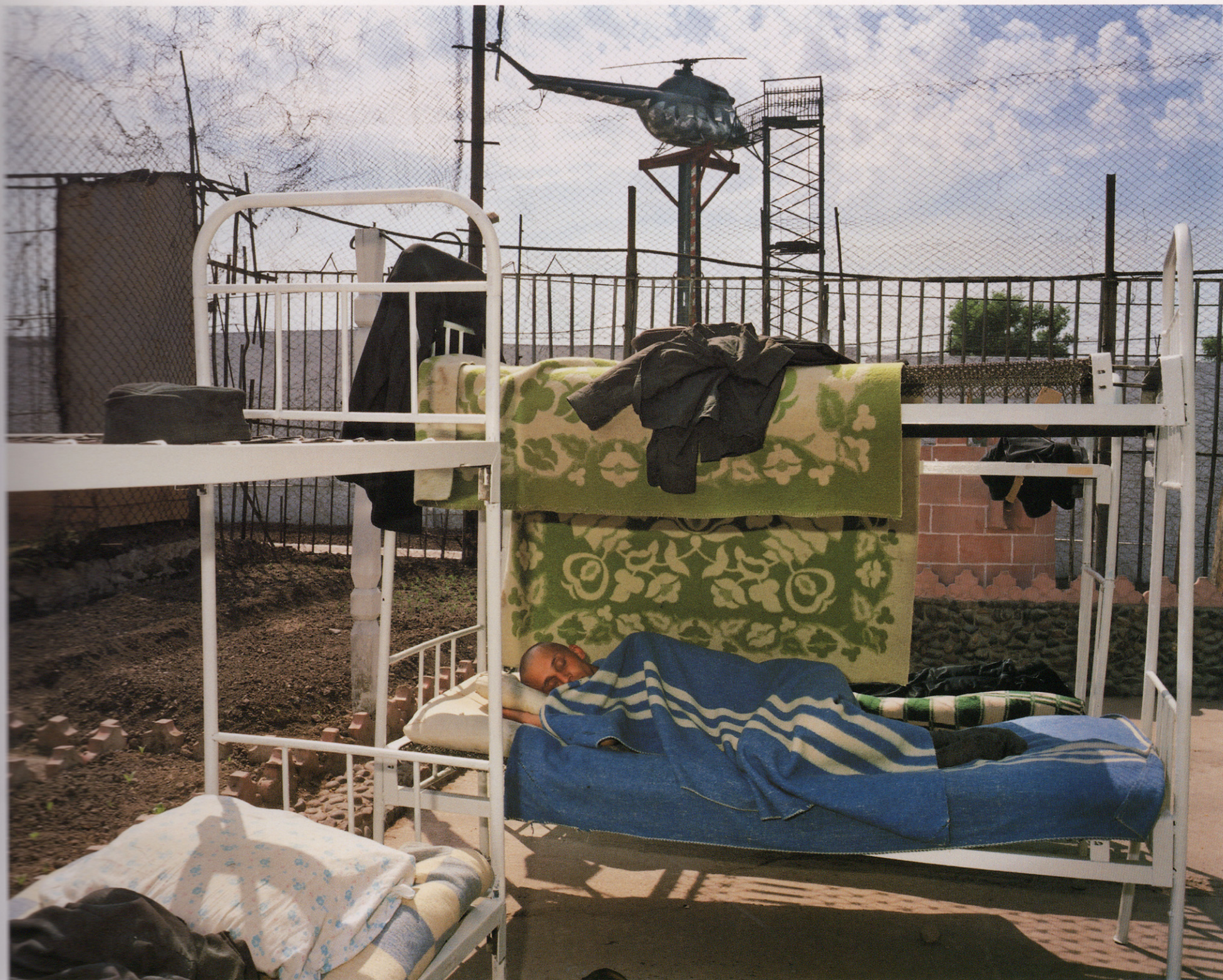
Prisoners sleep outside while dormitories are repainted, Krasnoyarsk, 2001