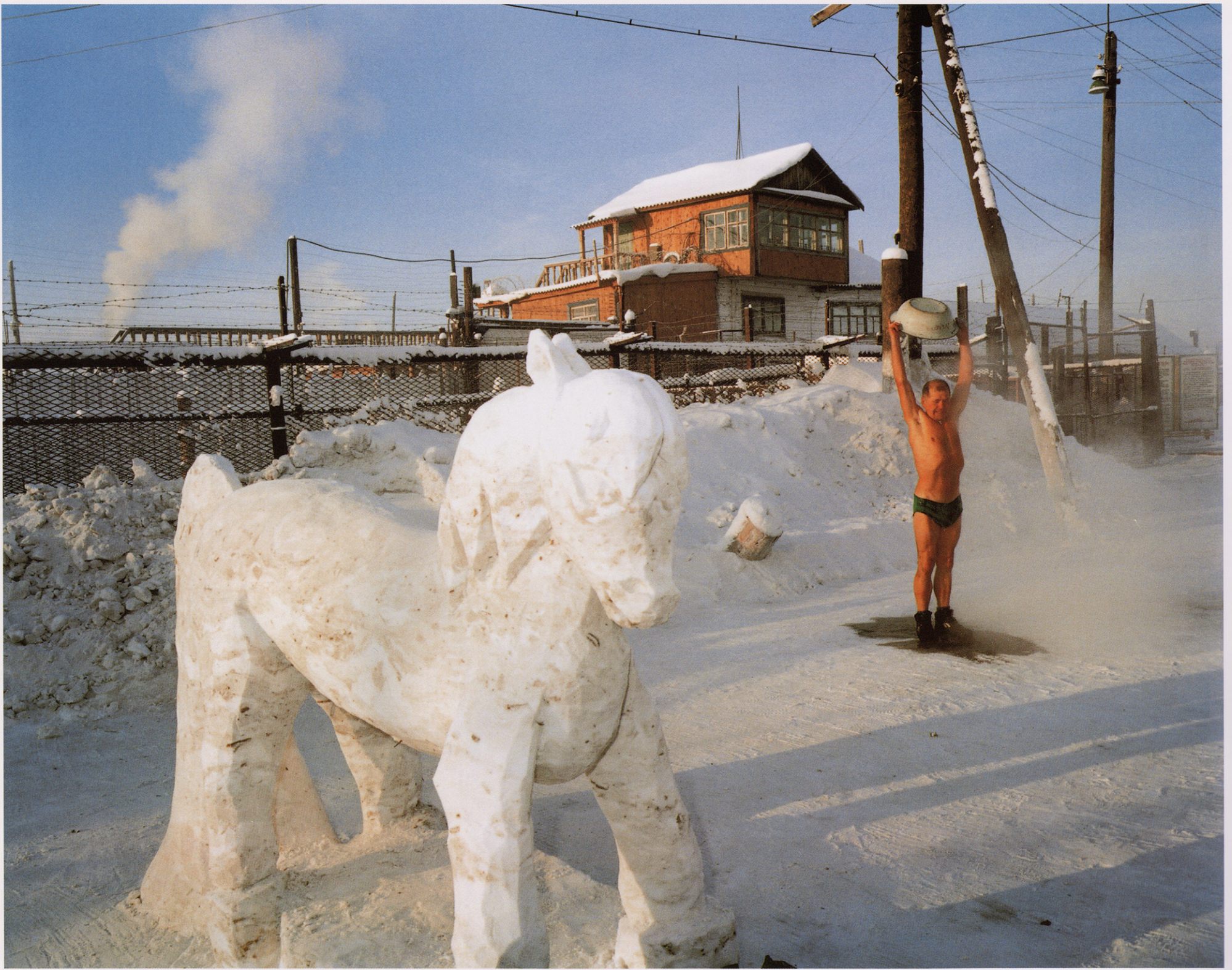
Prisoner demonstrates his resistance to temperatures of -50^{\circ}\text{C} by taking a shower, Novobirusinsk, 2002