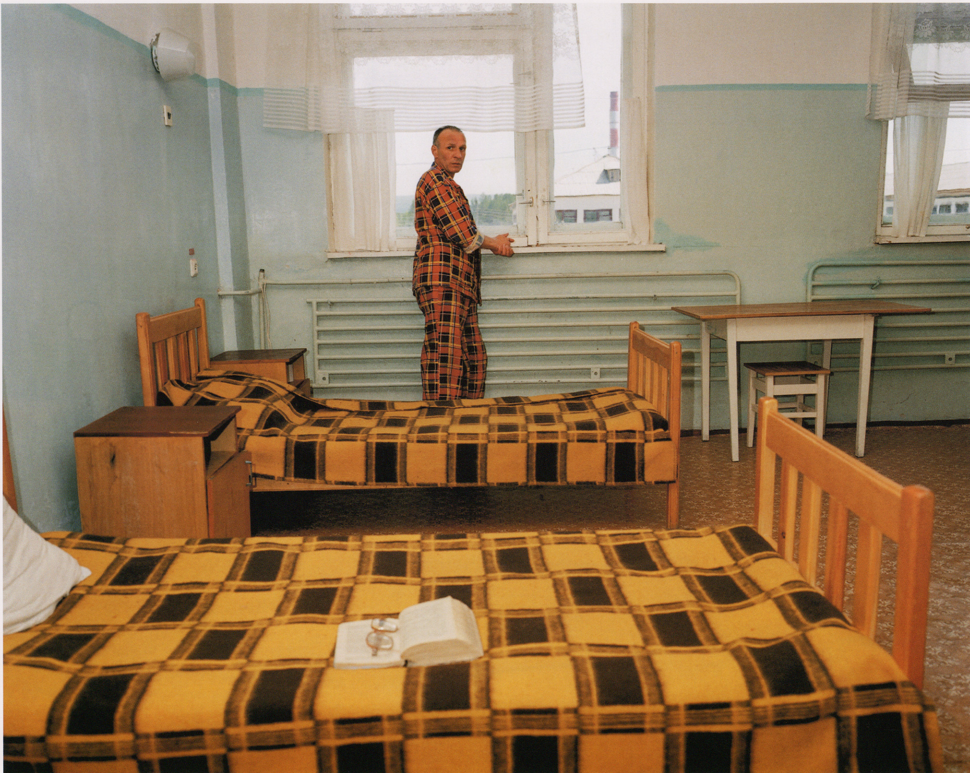
Hospital ward, Sosnovoborsk, 2001