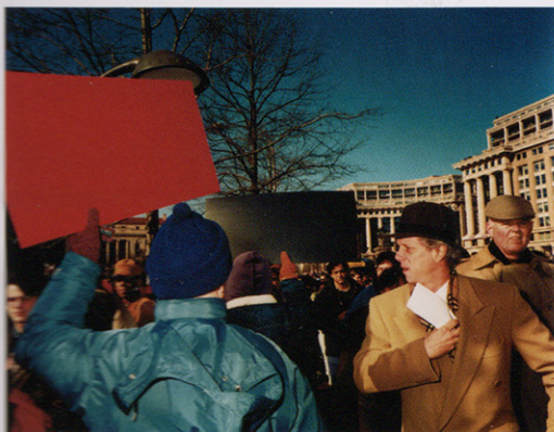
President Clinton's inauguration day, Washington, DC, USA, 1993. From De Keyzer's Tableaux d'Histoire series

In my work there's always been a duality between sticking to reality and trying to stage things. When I was working on India (1987) and again with Homo Sovieticus , I travelled to take pictures during the summer while I made staged photography in my studio during the winter. I hesitated for a long time about which side to take. Finally