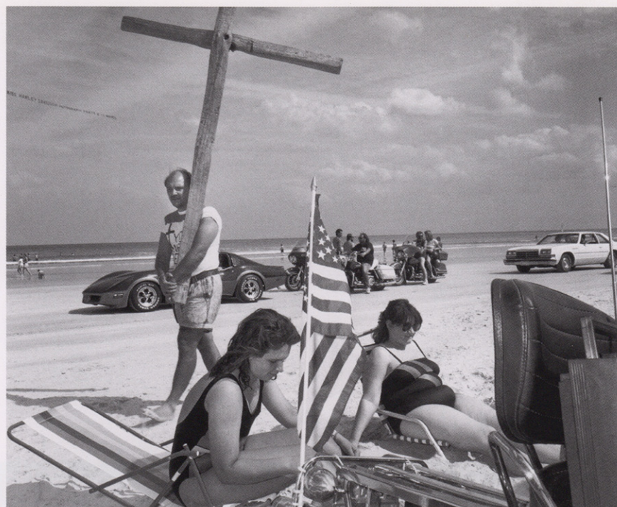
A group of religious motorcyclists called 'The Sons of God' celebrate the fiftieth anniversary of Bike Week on Daytona Beach, Florida, 1990

I realize this puts me philosophically at odds with most of the photographers in Magnum. Their approach is different. They are really interested in using photography as a way of exploring events or situations and the way they make pictures is often intuitive, whereas I have the template of the images I want in my head before I set out. Although the template in the case of God Inc. was photography from another period, most of the time it comes from a genre of painting – usually from paintings of the sixteenth and seventeenth centuries. For example, my Europa project (2000) was intended to be a statement about painting. The subject was Charles V. It started out as an assignment from the Charles V committee for his 500 year commemoration in Belgium. The idea of following Charles V's itinerary around his Empire appealed to me and in each town – Tarragona, Madrid, Florence, Siena – I would go to the museum to see what historical paintings they had of the locality. I didn't always find the ones I imagined, but they were in my head anyway. Then I went out into the streets to try to find situations that