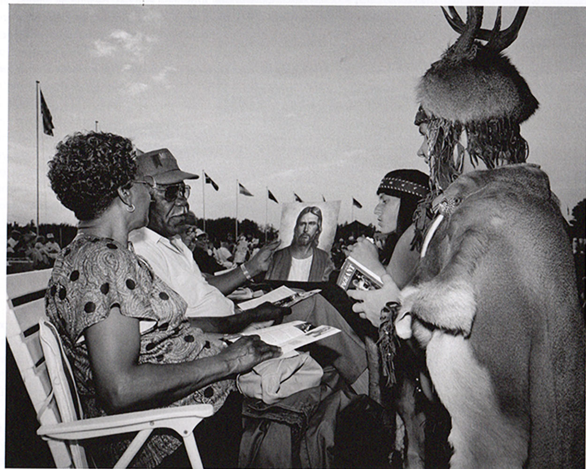
FIG. 38 Carl de Keyzer, The Hill Cumorah Pageant, The Latter Day Saints, Palmyra, New York, 1990.