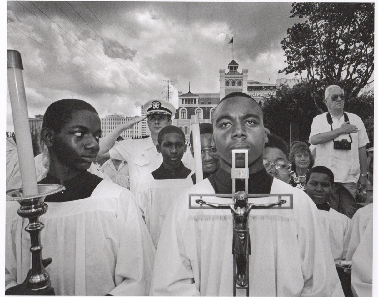
FIG. 36 Carl de Keyzer, Blessing of the River, Mississippi River, New Orleans, 1990.

It is this strange mix of documentary photography and fantasy that grounds de Keyzer's later work in Moments Before the Flood (2012) and Higher Ground (2016). Here the photographer continues to use dark humor and theater to address the looming questions of our current period.