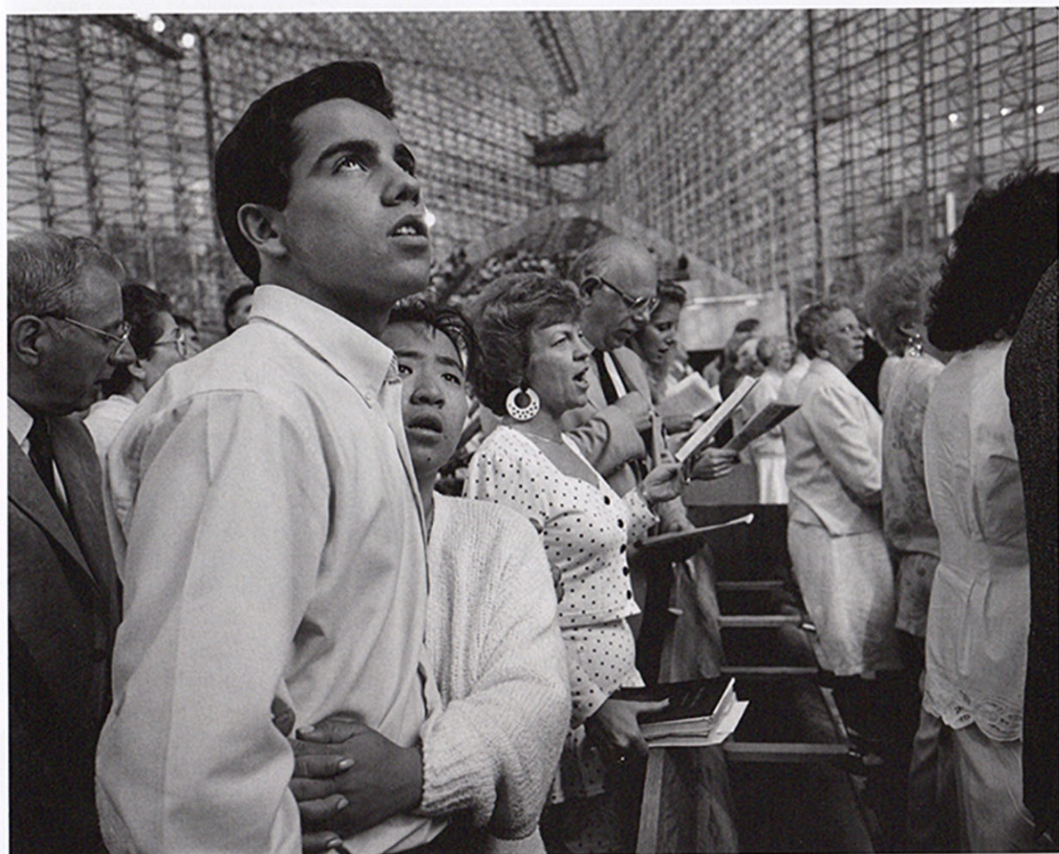
FIG. 37 Carl de Keyzer, The Crystal Cathedral, Anaheim, California, 1989.